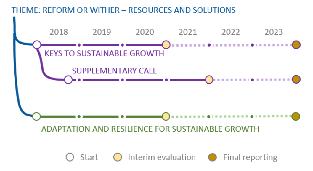
Figure 2. The SRC has launched two programmes under the strategic research theme Reform or Wither – Resources and Solutions: Keys to Sustainable Growth and Adaptation and Resilience for Sustainable Growth. The present call will supplement the programme Keys to Sustainable Growth. The broken lines indicate the second funding period. The funding for the second period is applied for separately and decided based on an interim evaluation (see 3.5).